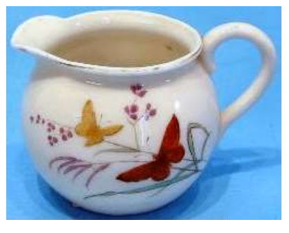
88 Taper jug, 95mm 89 Peel pot

87 Spherical jug, 63mm Butterflies and Grasses 60