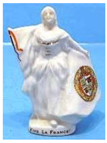
121 Shelley 406, Marianne, insc. "Vive la France" Portobello 110