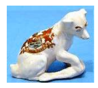
133 Shelley 506, Sitting Scott, purple Tam O' Shanter Carnoustie 20