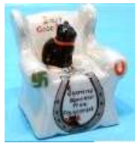
130 Carlton Black cat sitting on powder blue lustre armchair insc. "Jolly good luck" Black cat in horseshoe decoration, "A charming souvenir from Folkestone" 35