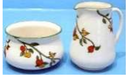
97 Taper jug and sugar bowl, 82mm Tomato Vines, Pair 32