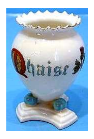
and Strawberry knop 36