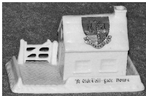
77. Grafton, Ye Olde Toll-Gate House, with gate and path Scarborough 15