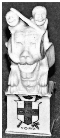
210 Arcadian, statue winged creature, imps and a man's face, all rather bizarre York 10